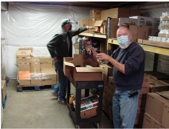
Volunteers boxing food at Luray Page One