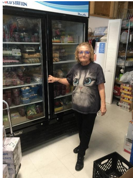
Volunteers at Shenandoah food pantry