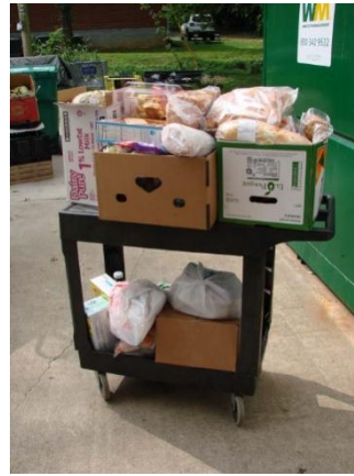
Luray Page One Food for family for 1 month